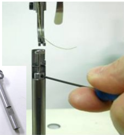
Specially designed looper

Micro adjustment of feed amount is possible with this dial knob.