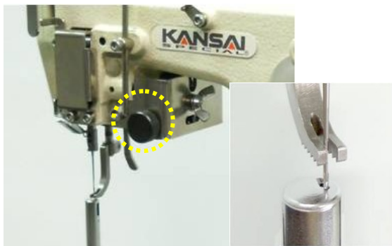
Upper feed system

Micro adjustment of feed amount is possible with this dial knob.