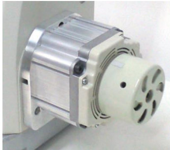
DM(Direct drive motor)