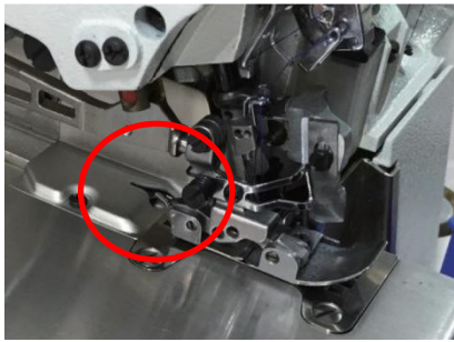
HTC(Horizontal chain cutter)

The chain cutter is located on the back of the needle plate.