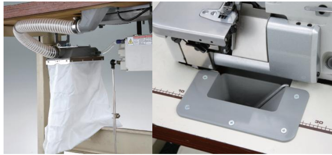
VD (Venturi device)