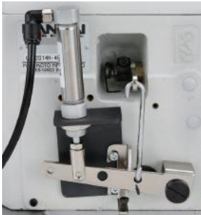
PL(Presser foot lifter)

Servo motor makes lower noise and lower vibration than clutch motor.