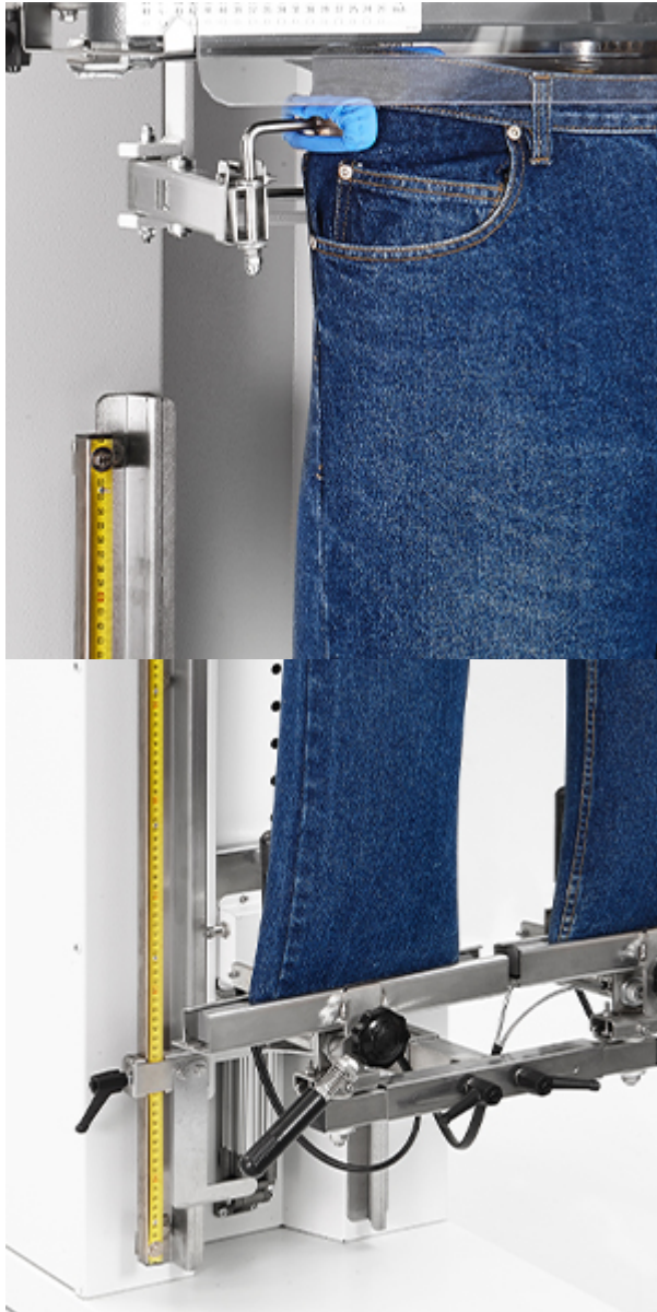
Waistband and leg size selectors, Enhanced tensioning