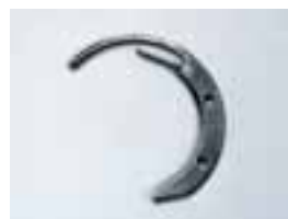
400-16408 Hook gib VS

Soft seams can be produced by lowering the bobbin thread tension.