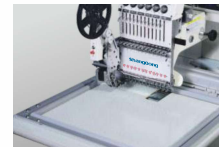
可选配晶片绣 Optional for sequin device