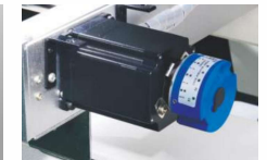
高品质电机，刺绣速度提至1200RPM High quality motor, increasing speed to 1200rpm