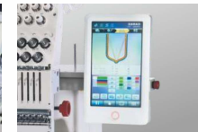
8寸触摸屏，带USB端口 8" touch screen with USB