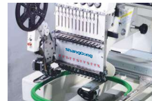
成衣绣 Clothes embroidery

It includes cap, flat, clothes embroidery function and can be optional for sequin device, coiling device, boring device. This model is equipped with 8" control panel, running at maximum 1200 RPM. 400 patterns can be stored, up to 16 million stitches.